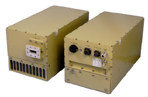
CPI 30/50 W GaAs X-band BUCs, Models UB61050, shown here with rear and front views

Backed by over 40 years of satellite communications experience, and CPI's worldwide 24-hour customer support network that includes more than 20 regional factory service centers.