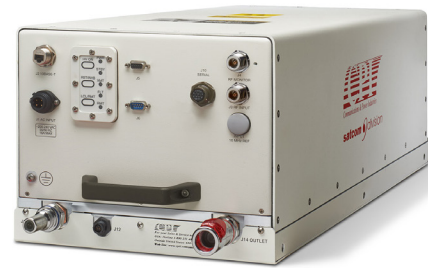
CPI 1.25 kW Ku-band SuperLinear outdoor TWTA, Model TL12UO-L1

Modular design and built-in fault diagnostic capability via remote monitor and control.